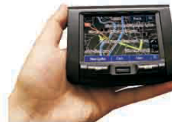
GPS (GLOBAL POSITIONING SYSTEM)