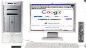
PERSONAL COMPUTER (PC)